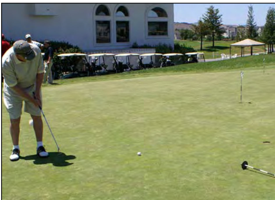
One of the most consistently popular events of the entire Local 38 Golf Tournament is the putting contest. Entrants pay $5 for a shot at winning $5,000. To win a competitor must sink three putts, each one successively longer than the previous one. Despite numerous entries over the past two years, nobody has actually won the grand prize, although some have come close. Still, there's never a shortage of those willing to try.