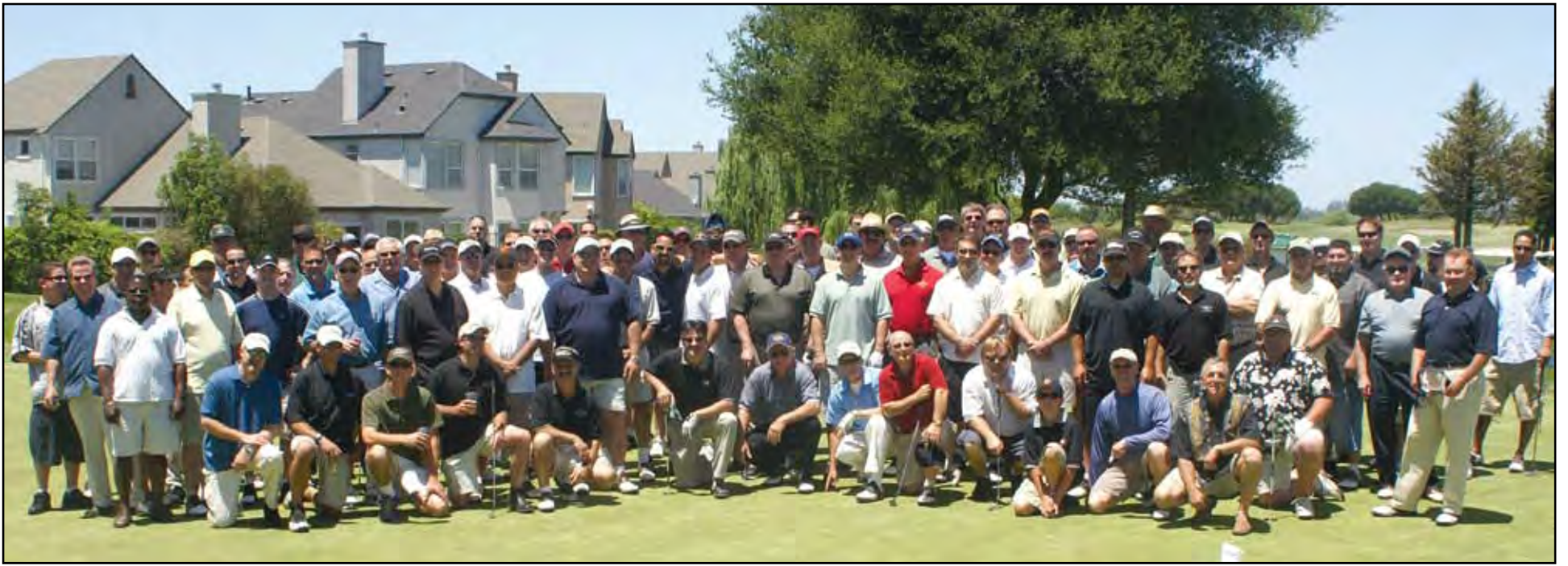
More than 140 players gathered at the Annual Local 38 Charity Golf Tournament at the Adobe Creek Golf Course in Petaluma last month, helping to raise over $17,000 for the fight against domestic violence.