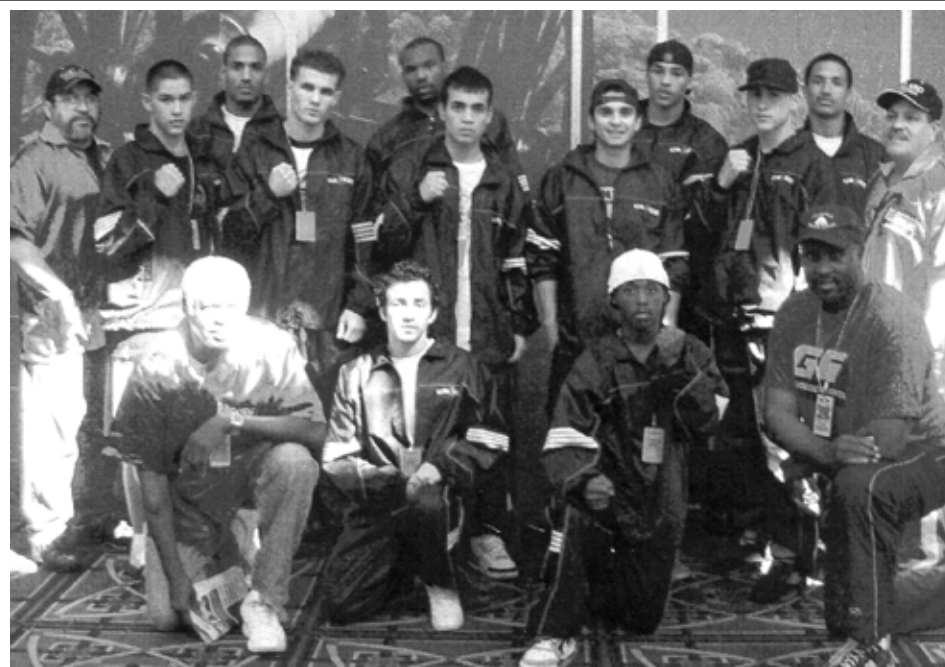
The Northern California Golden Gloves Boxing Team of 2007, sponsored by community and labor groups from throughout the community, included four fighters who made it to Medal Rounds, meaning they will be ranked and seeded into the Olympic Trials or the United States National Boxing Team.