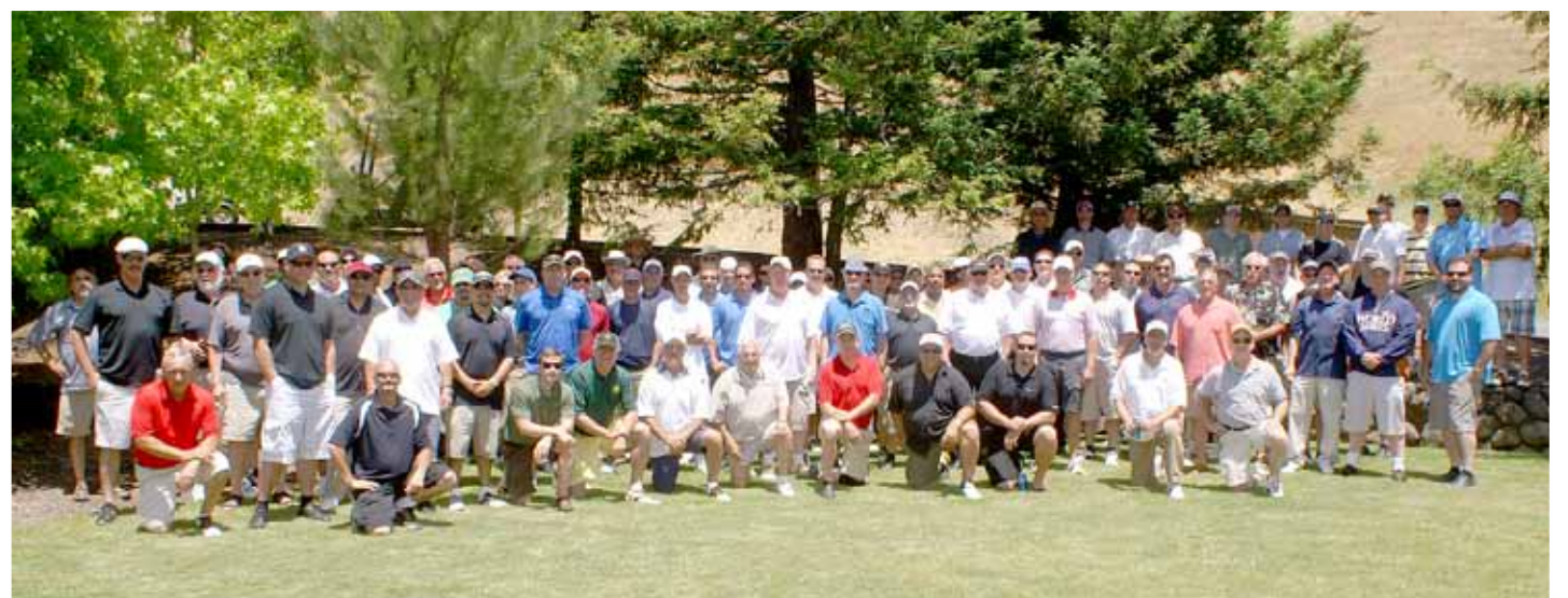
More than 100 golfers gathered in front of the San Geronimo Golf Course to kick off the 22nd Annual Local 38 Charity Golf Tournament, held last month.